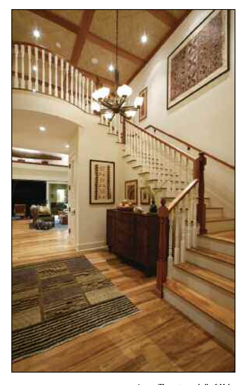
ABOVE: The entrance hall of Maha Olu is decorated with varying sizes of kapa cloth bark from around Polynesia including Hawai'i, Tonga, Fiji and Samoa. A beautiful handwoven blue rug mirrors the kapa patterns.